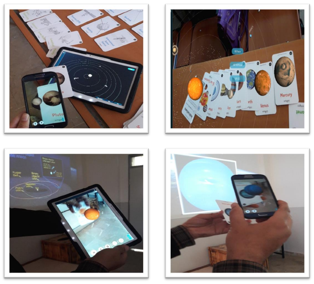
Figure 1. Sample images for the application process of the experimental group

their textbooks, listening to the instructor and participating the activities just when questions are directed to them. Sample images for the AR application can be found in Figure 1.