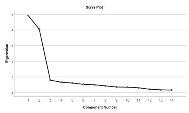
Figure 1. Scree plot of AAS items after EFA

As seen in the scree plot, there are 3 factors in the AAS. To see these 3 factors more distinctly, the "Varimax" axis rotation method was used. The subdimensions (subfactors) arising from this procedure and the level of variance explained by each dimension are shown in Table 3.