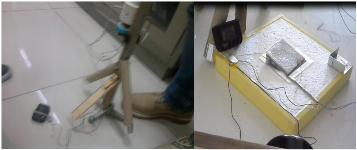
Figure 2. Final model MB1 and MB2 for the second activity

MB3 and MB4 were in the same group and they showed little conceptual growth. The first model they created focused on the relationship between friction and heat. They tried to make a correlation between free fall and height in their second model. Since they did not analyze force diagrams in none of their models and could not take much measurement on their models, they might not improve their understanding. These findings seem to be in agreement with Löhner et al. (2005)'s expectation that the different representations used in modeling tools may have differential effects on students' reasoning processes. Likewise, Ogan-Bekiroglu (2007) concluded that the closer students' models were to the real situations, the more scientific conceptions they gained. The limitations of their models might not facilitate conceptual progress of MB3 and MB4. While MB3 and MB4 were presenting their second model, the following conversation occurred between them and the instructor: